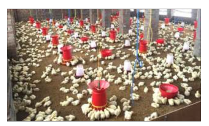
Setup of 3000 broiler birds in poultry farm after intervention by KVK Amritsar

strengthening linkage with small/traditional poultry farmers of the area for taking up poultry farming on a big platform. His future plans are to expand his unit upto 10,000 broiler birds and also start a new poultry farm of layer birds integrated with fish farming. He is also planning to enter in the field of value addition of poultry meat.