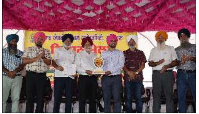
Awarded with "Award of Honour" in the field of Poultry farming by Punjab Agricultural University